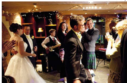
The Cellar Bar